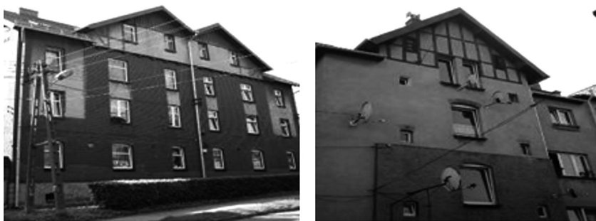
Fig. 1, 2. Pyskowice, examples of the building development of railway housing estate, visible frame construction of the attic's walls

Buildings described and analyzed in this paper are three-floor basement residences, covered with wooden roof rafter framings. Construction material of external and foundation walls is of ceramic brick. Wall thickness depends on the floor level, traditionally, in the ground it is most commonly 52 cm, decreasing towards the top. Dormer's peaks, in their entirety