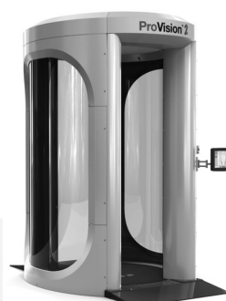
Ill. 4. Scanning gate, system ProVision® 2

In another of the discussed systems (Ill. 3), a solution is dedicated to the newly constructed terminals or “check-in” zones subjected to profound modernization, integrating stand, self-check identification and baggage transfer at the airport. Such solution modules can perform all basic tasks and initial safety assessments of the deposited baggage. See Paris Orly West Terminal operating since 2011.