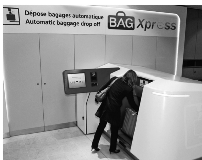
Ill. 3. ALSTEF baggage control system – the identification and marking of the baggage is performed in a self-service manner. The system requires adjustments, re construction and architectural design of “check-in” to meet new solutions

The Scan&Fly (Ill. 2) system operates the most important functions concerning baggage, enabling passengers to mark their baggage with an identification number, to print the boarding pass, scan, read and compare the data on the baggage identification card and the boarding pass, and make excess baggage limit payments. The system is easy to operate and is integrated with the existing baggage receipt system already functioning as classic “check-in” stands, for example: Rotterdam, The Hague.