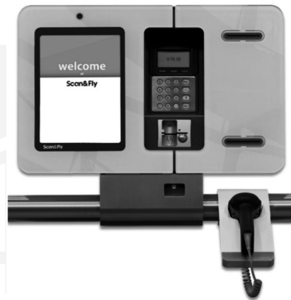
Ill. 2. Scan&Fly baggage service system – identification and marking of the baggage is done by the passenger. One of the advantages of this system is easy integration with the existing check-in stands