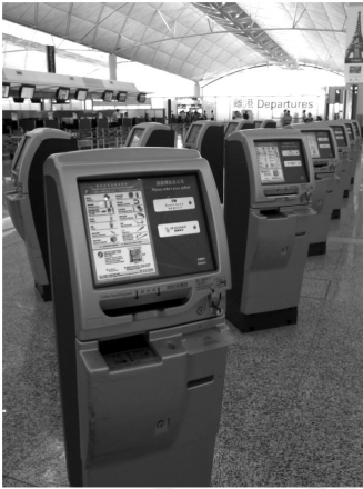
Ill. 1. Kiosks at the international airport in Hong Kong

The range of services offered by the kiosks depends on the software and additional equipment such as printers or other I/O options (credit card readers). The installation of the elements making up the system of the kiosks, requires access to the infrastructure of the facility and appropriate spatial layout with extra space for users. The space provided for one kiosk should secure free accessibility and a guarantee of minimal privacy in the course of using the system. The spatial layouts of the kiosk installation zones (Ill. 1) are conditioned by the dimensions of the space selected from the classic waiting hall and communication in the direct vicinity of the baggage check-in.