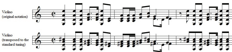
Ex. 2: Anonymous, Respice Mater filios , cat. No. RM 6641, the part of Violino (original with scordatura and transposition to the standard tuning), bb. 1–3.

Also other structures found in the Respice Mater filios would be impossible or very difficult to perform in a standard tuning, if only due to the necessity of frequent changes of position and use of half-position. It might seem that this technical aspect decided to use the changed tuning in this piece. The texture, however, suggests another possible explanation. Well, in almost the entire voice of Violino there are multiple stops, with the dominance of triple and quadruple stops. Of course, at a time when the discussed manuscript was written, this technique was widely used. However, like any other technical aspect of playing this instrument, it was associated with its idiom. In this case, it concerns both the left hand—as already described—and the right hand. Due to their construction, the violin is primarily a melodic instrument. Its arched stand causes that the individual strings are